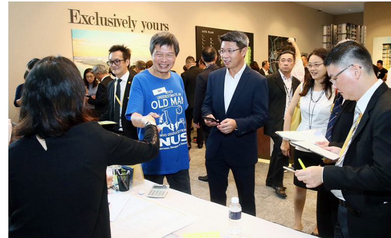
> A happy buyer who secured his choice unit

During the Amber45 weekend launch on 12 to 13 May 2018, UOL sold 80 of the 100 units released, at an average price of about $2,200 psf. The strong sales performance was within expectations given the enthusiastic response from prospective buyers during its preview two weeks before, which attracted more than 3,000 people over two days.