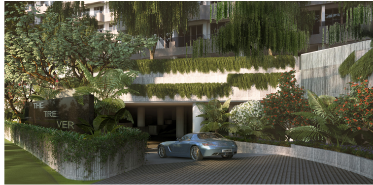
> The Tre Ver (artist's impression) won two awards at the International Property Awards (Asia Pacific) 2018

The winners of the awards were announced at IPAX Asia Pacific, an exhibition and networking summit for the property and real estate industry which took place in Bangkok, Thailand from 3 to 4 May 2018.