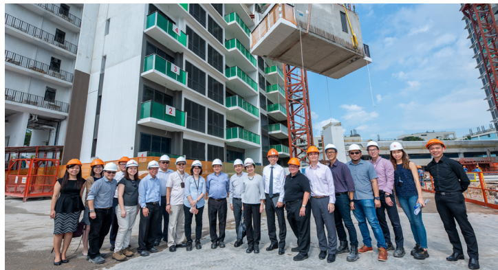
> UOL staff and HDB officers witnessed the hoisting of the last PPVC module at The Clement Canopy

public housing projects in future. During the visit, the visitors also witnessed the hoisting of the last PPVC module for The Clement Canopy, a mere one year after the first module out of a total of 1,866 modules was installed. The project is expected to receive its temporary occupation permit in the first half of 2019.