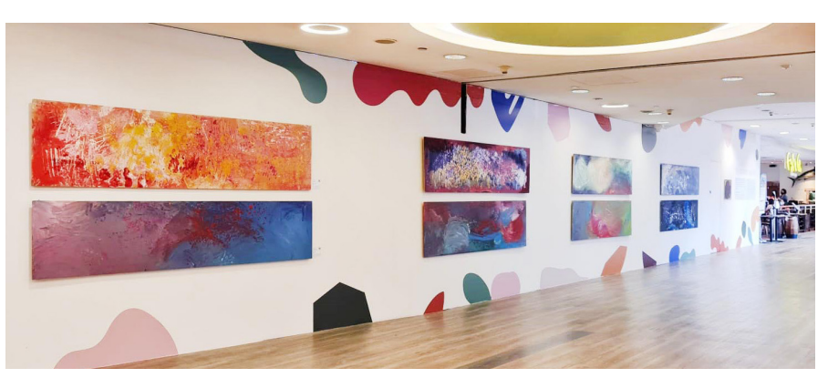
An art showcase on the hoardings at Velocity@Novena to help raise awareness for Extra•Ordinary People.

To UOL, art promotes expression and creativity, and builds communities.