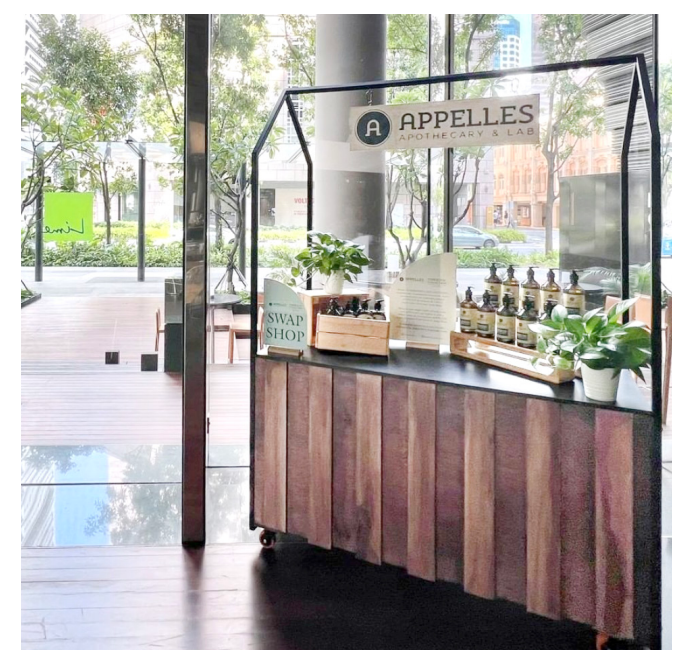
PARKROYAL COLLECTION Pickering Swing by our Appelles Swap Shop pop-up counter on Fridays between 4pm and 5pm to exchange your empty recyclable bottles for a complimentary bottle of Green Body Wash. #shareyourmoments a: parkroyalcollectionpickering

March your way to good health at Velocity. Join us at our FREE workout sessions held every Wednesday from 6.30pm-7.30pm at Velocity Outdoor Court! #FitnessAtVelocity : velocity_nsq