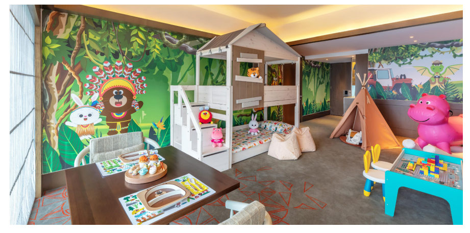
Kids will be entertained in the jungle-themed room, along with bath toys for a fun soak in the tub.

With the opening of its first children's play area along with themed family suites in February 2022, Pan Pacific Singapore hopes to enrich the holiday experience for families with young children.