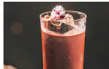
Silverleaf is a Tom Dixon-designed bar featuring unique drinks with a touch of vibrant colour coming from edible garnishes.

also greeted on arrival by an animated stainless steel light sculpture custommade by the design studio.