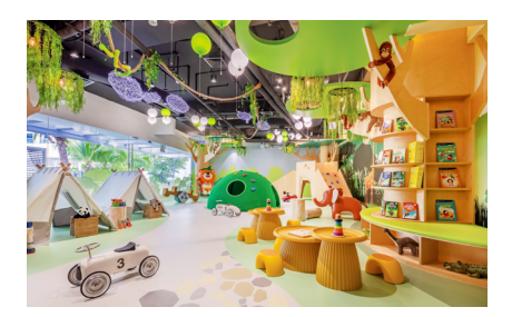
The Urban Jungle Village is an indoor play area accessible only by guests staying at the hotel.

Based on the storyline of eight jungle friends on an adventure to explore the Marina Bay area, the Urban Jungle Village is every child's wonderland with seven activity zones that integrate thinking, learning and play activities. They include a treehouse above a virtual pool for the little ones to put their fishing skill to