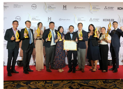
UOL scooped up the most accolades at the Singapore chapter of PropertyGuru Asia Property Awards 2022.