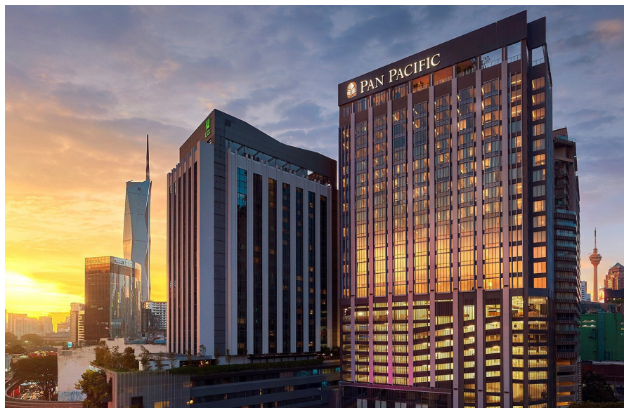
Pan Pacific Serviced Suites Kuala Lumpur is the latest addition to the Group's network of serviced suites in 2022.