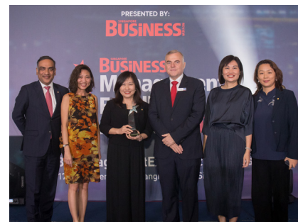
PPHG won Team of the Year award at the Singapore Business Review Management Excellence Awards 2022 for the successful launch of the sustainable hospitality brand – PARKROYAL COLLECTION.