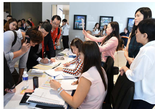
> A buyer securing his choice unit.