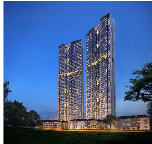
> Artist's impression of Avenue South Residence.